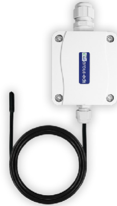
SK10-TC-GTF-TPE Rubber Sensor IP68 2m thermoplastic elastomers