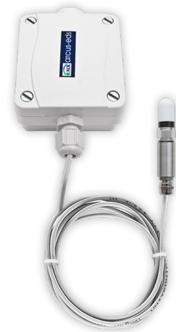
SK10-TC-RPTF1 Pendulum Room Sensor 1.5m PVC