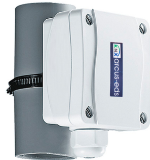
SK10-TC-ALTF2 Contacting / Tube Sensor