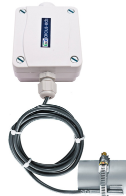
SK10-TC-ALTF1 Contacting / Tube Sensor 1.5m ( PVC / Silicon )