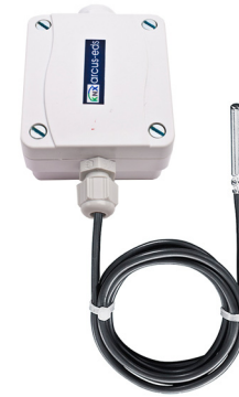
SK10-TC-HTF Sleeve Sensor 1.5m ( PVC / Silicon / PTFE )

Article No. 30511002, 30511003, 30511055