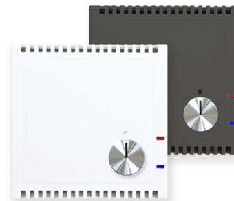
SK30-TC-R white / anthrazit