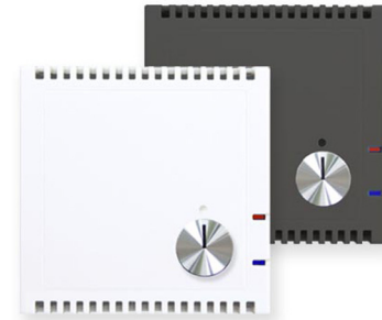
SK30-TTHC-R white / anthrazit