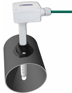
SK10-TTHC-KFF + ext. PT1000 Connector