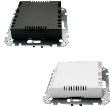
SK03-T with Integrated Temperature Probe