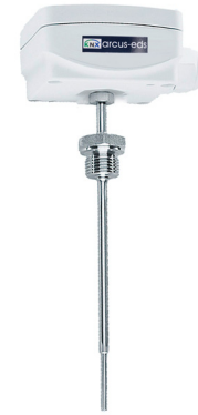
SK01-T-ETF7 with Screw-In / Immersion Probe Probe length: 100, 150, 250 mm with Extended Shank and Neck Tube, V4A