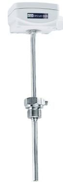
SK01-T-ETF3 with Screw-In / Immersion Probe Probe length: 50,100,150,200,250,300,400 mm with Extended Shank, V4A